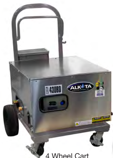
4 Wheel Cart