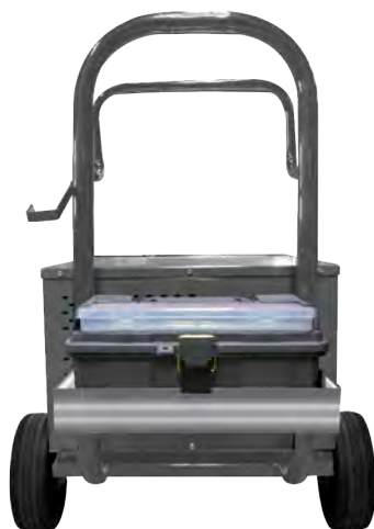
Tool Box Available on 4 wheel cart only