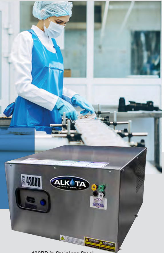
430BD in Stainless Steel

Alkota provides the longest-lasting and most dependable equipment for high-pressure cleaning and sanitation applications.